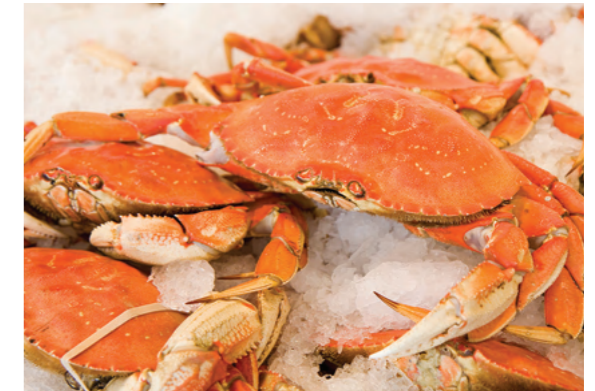
H & H Fresh Fish

La Marea of the Sea offers holiday fresh oyster platters with delectable condiments as well as catering. In addition to locally caught fish, H&H Fresh Fish offers fresh Dungeness crab (available at the harbor shop), scallops, unshucked oysters, and mussels. You can order platters of shucked oysters that arrive nestled on a bed of chilled rock salt along with their festive house-made mignonette, horseradish, and lemons. Be sure to inquire about their catering services, too.