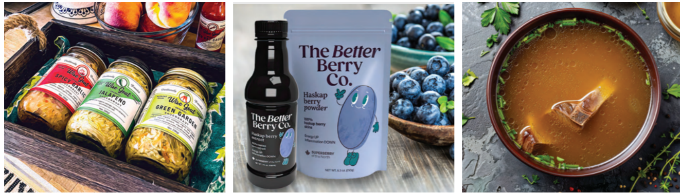
Wild Goat Organics