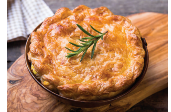
Bay Living Culinary