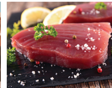
H&H Fresh Fish