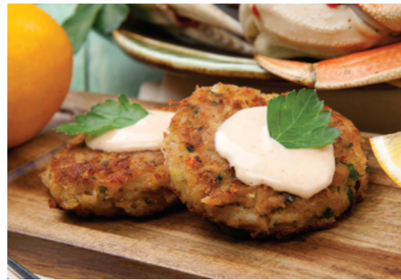
H&H Fresh Fish