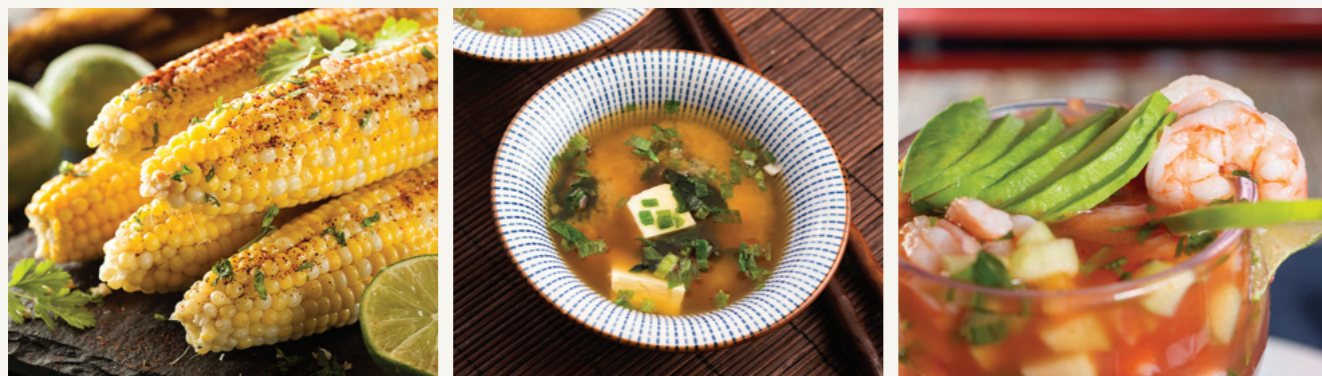
Lily's Roasted Corn

Holiday shopping is hard work, but we'll get you through it! Stop by Lily's Roasted Corn and Potatoes for a hot roasted potato (and their great selection of toppings!) for a quick bite or pick up a bag of warm, freshly roasted peanuts. La Marea serves their fabulous seafood tacos and tostadas on freshly-made-on-the-spot hot corn tortillas. Or, pick up a hot cup of miso soup or a rice bowl at Zen Natural Foods . The various fillings include wild salmon, crab, and chicken.