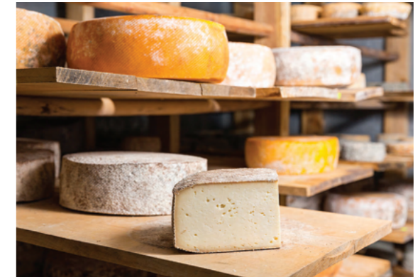
Rocky Oaks Goat Creamery

Schoch Family Farmstead offers a wide selection of locally made cheeses that are delicious for holiday party platters or gift baskets. Cheese varieties include aged Monterey Jac, East of Edam (Gouda), Mt. Toro Tomme, and Junipero, a Swiss-style cheese. Rocky Oaks Goat Creamery offers both fresh and aged goat cheeses including Gouda, Feta, Brie, Chevre, and Manchego.