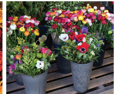
Santa Rosa Flowers