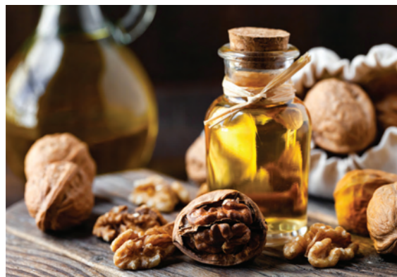
Manzanita Manor Organics

In addition to their dry-farmed walnuts, Manzanita Manor Organics offers their exquisite cold-pressed organic walnut oil. If there's a gourmand in your family, this is the perfect gift. Walnut oil can be used as a finishing oil or as part of a special salad dressing.