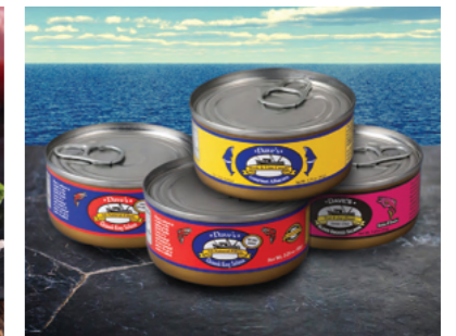
Dave's Gourmet Seafood

M.I.F. Seafood offers frozen sustainably sourced, wild caught Sockeye salmon and halibut harvested from the pristine waters of Bristol Bay. And don't miss their award-winning cold smoked salmon! H & H Fresh Fish offers locally sourced fish including ling cod, jack mackerel, rockfish, and much more. Gift packs of canned albacore and salmon are available at Dave's Gourmet Seafood .