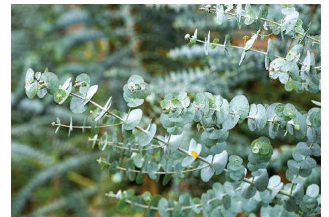
Mora Family Farms