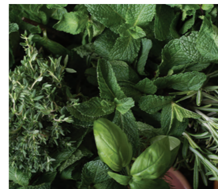
Pacific Rare Nursery