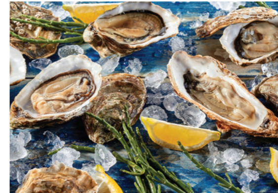
La Marea of the Sea