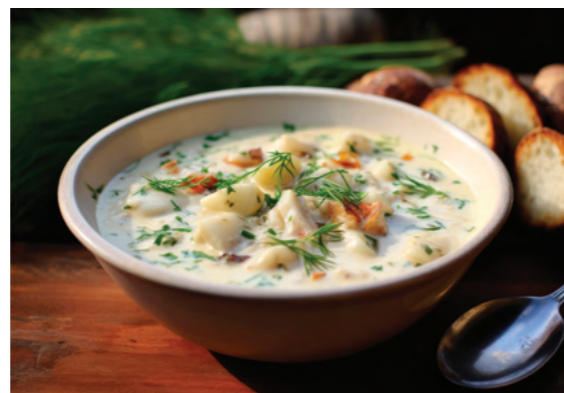
Bay Living Culinary