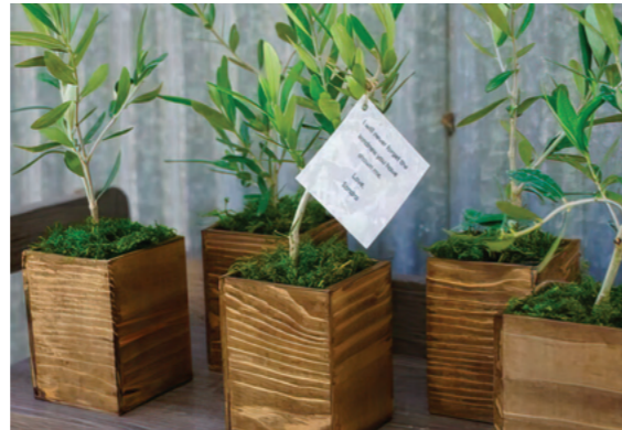
Sacred Tree Nursery

Belle Farms offers exquisite, sustainably farmed, extra virgin olive oil. The olives are hand-picked and cold-pressed within 24 hours of picking to maintain their exquisite flavor and health benefits. This is also the time to purchase Olio Nuovo ('new' olive oil and the first pressing) for your favorite chef. In addition, olive trees are available from Belle Farms and Sacred Tree Nursery .