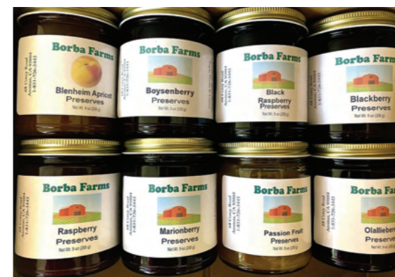
Borba Family Farms