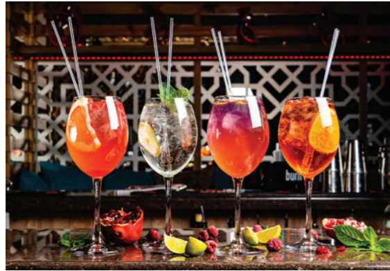
Rancho Padre Farms

Our farmers have not missed the trend for alcohol-free beverages! You'll find freshly brewed, small batch kombucha at Living Swell Kombucha . Rancho Padre Farms offers cold-pressed juices that make a delicious base for punch or holiday drinks. Unique mixers are now available at Prevedelli Farms and Wise Goat Organics — just add a splash to sparkling water or your favorite cocktail.