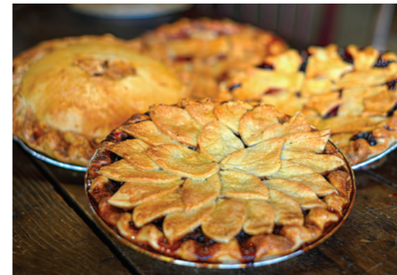
Sweet Elena's Bakery Café