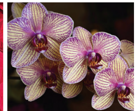
Bay Area Orchids