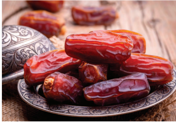
Flying Disc Ranch

Just in time for creating your own homemade gifts or holiday baking — restock the pantry with raisins, dates, dried cherries, dried apricots, persimmons, almonds, walnuts, pecans, and pistachios. Visit Schletewitz Family Farms, Minazzoli Farm, Pulido Farms, CE Farm, Flying Disc Ranch, and Manzanita Manor Organics for ingredients for this year's treats. Need ideas for gifts from your kitchen? Visit www.edibleparadise.com for delicious recipes!