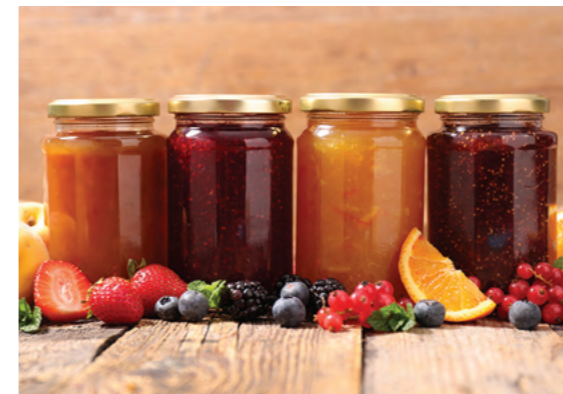
Mora Family Farms

Small batch, artisan jams, fruit butter, and marmalades are available at Mora Family Farms and Prevedelli Farms . Borba Family Farms also has jam. Wise Goat Organics offers a line of savory mustards and salsas. Minazzoli Farm has almond butter and jams.