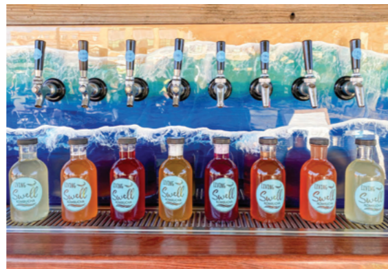
Living Swell Kombucha