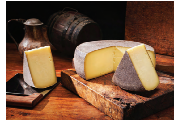
Schoch Family Farmstead

Schoch Family Farmstead offers a wide selection of locally made cheeses that are delicious for holiday party platters or gift baskets. Cheese varieties include aged Monterey Jac, East of Edam (Gouda), Mt. Toro Tomme, and Junipero, a Swiss-style cheese. Rocky Oaks Goat Creamery offers both fresh and aged goat cheeses including Gouda, Feta, Brie, Chevre, and Manchego.