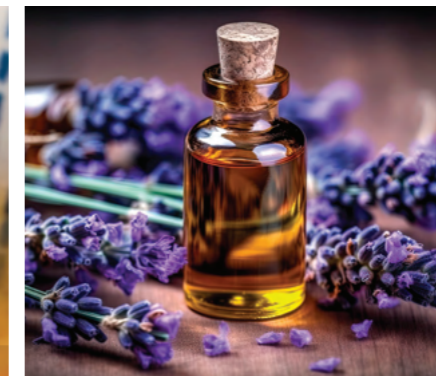
Lavender Creek Company