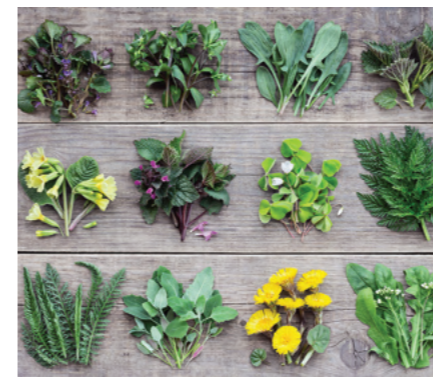
Cabrillo College Horticulture