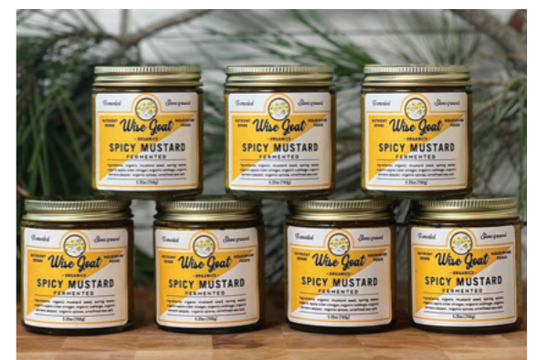
Wise Goat Organics