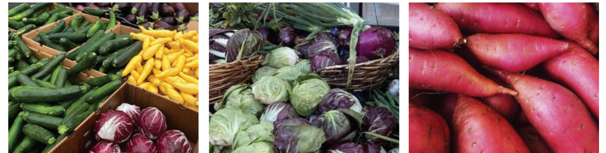
Phil Foster Ranch

Discover the vibrant flavors of winter at our farmers markets, where certified California-grown produce shines. From crisp greens to juicy seasonal fruits, you'll find the freshest and most delicious selections around. Our dedicated farmers use sustainable methods, grow heirloom varieties, and harvest their produce at peak ripeness—often just hours before market day. It's the perfect way to nourish your family while supporting local agriculture this holiday season.