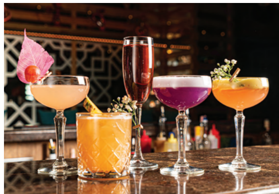
Wise Goat Organics