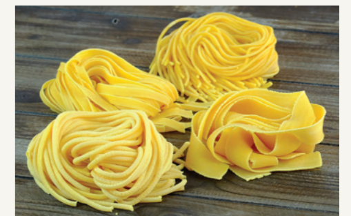
Bigoli Fresh Pasta

Bigoli Fresh Pasta brings the taste of Italy to your table with an exceptional selection of freshly crafted artisan pasta, made from 100% imported Italian durum semolina. From tender ravioli and pillowy gnocchi to indulgent trays of cannelloni and lasagna, each dish is a celebration of authentic flavors. Complete your meal with their mouth-watering sauces, perfect for elevating any occasion, whether it's a festive gathering or a cozy weeknight dinner.